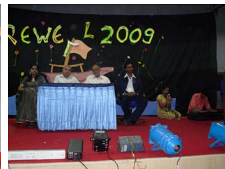
Farewell to B.Tech.(D.T.) 2009 Batch