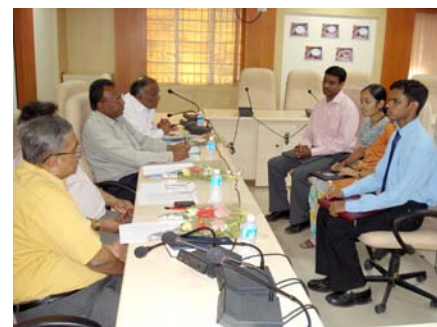
Campus interview in progress...

The number of students who were selected by various dairy plants are as under.