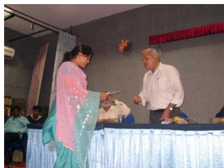
Certificates being awarded to students on Annual Day

they earned in 'inter-semester' events like sports, literary, fine arts and cultural. A 'cultural evening' was organized where our students entertained the enthralled audience for 2 hours. The function was followed by a sumptuous dinner, where the students interacted with the faculty.