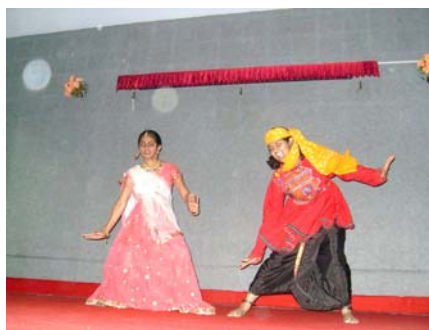
Annual Day Cultural Fete.....