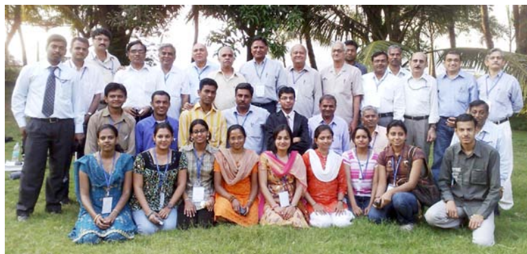
Alumni meet at Dairy Industry Conference at Panjim, Goa