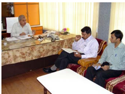
Dairy Plant Personnel for Campus Recruitment