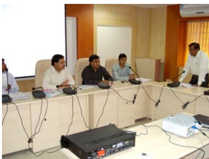
Campus Recruitment - Briefing them about our graduates